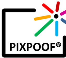
Photo editing and enhancement