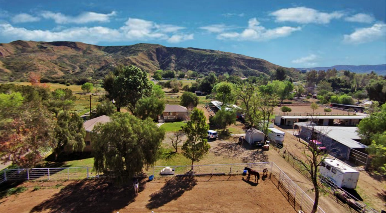
Santa Clarita Drone Photography santaclaritadronephotography.com